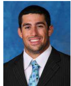
Joseph Orlando Anthony Dominic Fiacchino Memorial Scholarship Funded by Aerostar Global Logistics